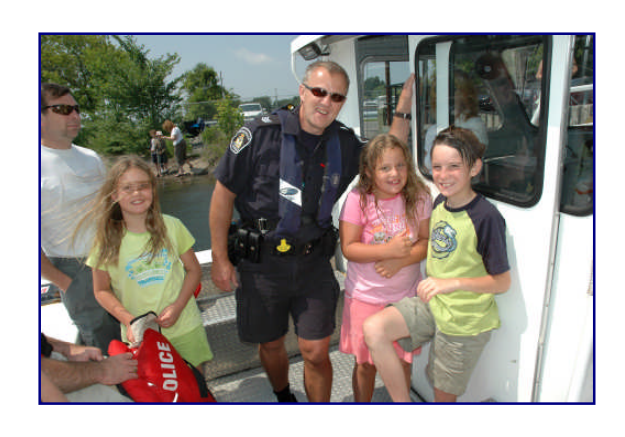
Visibility and Presence